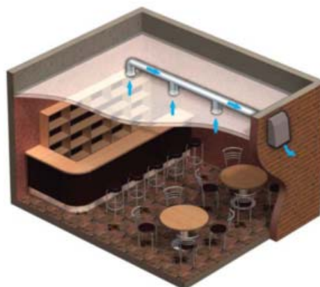
BAR VENTILATION EXAMPLE

For more information on available accessories, see pages J8-J11 in Accessories & Motors section.