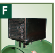
MCVR - MOTOR & BELT COVER