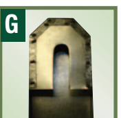
BLG - BELT GUARD