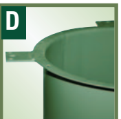
SCV - VERTICAL SUPPORT CLIPS