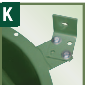
SCH - HORIZONTAL SUPPORT CLIP