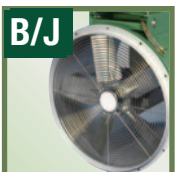
MC - GUARDS