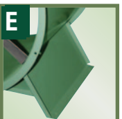
SPL - SUPPORT LEGS