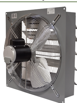
12" to 48" MODELS BACK VIEW

Canarm/LFI's standard fans follow a tradition of quality in design, materials and construction. All our standard fans are developed to be efficient and economically priced. Fans are available in single, two and variable speed models. All variable speed standard fans use an energy efficient variable speed, dual voltage motor and blade combination. To determine the proper Canarm/LFI fan for your applications, use the formula and table shown on back of page.