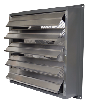
12" to 24" MODELS FRONT VIEW