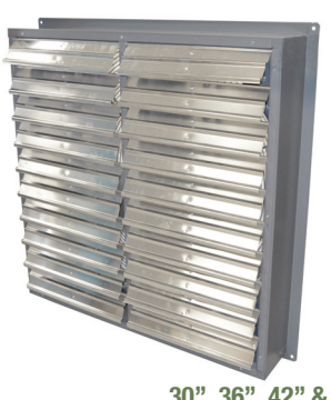
30", 36", 42" & 48" MODELS WITH ALUMINUM LOUVERS