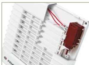
FAN OFF - LOUVER SHUTTERS CLOSED

Sleeve bearing motor ensures quiet operation and designed for operation up to 20,000 hours. Suitable for air stream temperature from 34 °F to 113 °F.