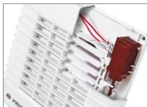
FAN ON - LOUVER SHUTTERS OPEN