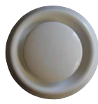
EXHAUST & SUPPLY GRILL