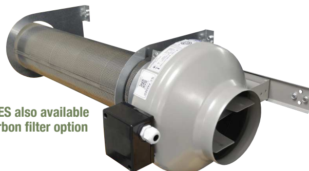
DFRC-6ES also available with carbon filter option