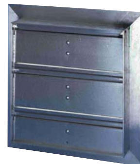
BACK DRAFT DAMPER

The Motorized dampers listed above are 110/230V. For 24V AC, replace X with Z.