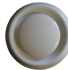
EXHAUST & SUPPLY GRILL